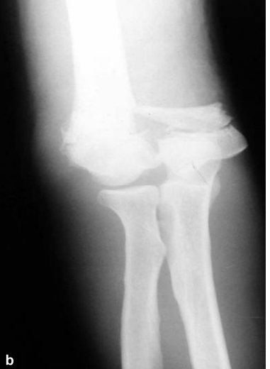
Figure 1 a - b. Preoperative roentgenogram of the left elbow of a C_3 type fracture (Case 7).

Dicle Tıp Derg / Dicle Med J Cilt/Vol 36, No 4, 241-247